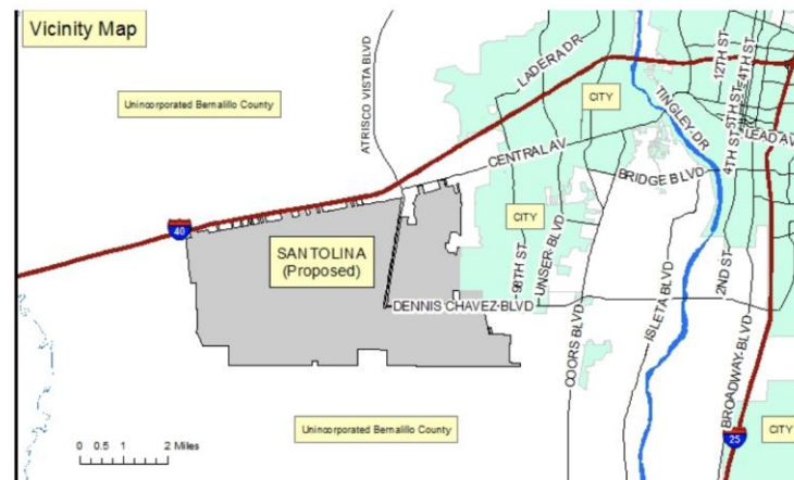
The proposed location for the Santolina project.