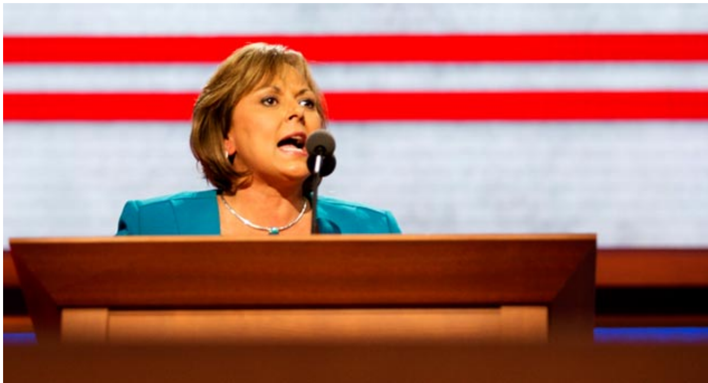
Susana Martinez, Governor of New Mexico, giving a speech on August 29, 2012 at the Republican National Convention.